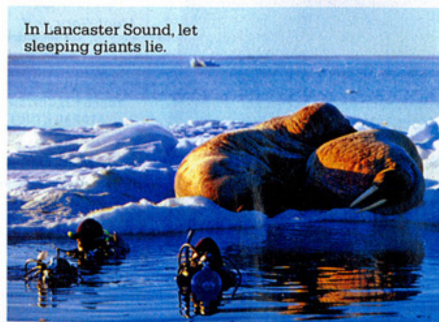
In Lancaster Sound, let sleeping giants lie.

the continent: remote, pristine, and stocked with thousands of leviathans. Located in the foothills of the Torngat Mountains, the river has only 20 miles of fishable territory, and the Flowers River Lodge has sole access. Keep an eye out while you're casting — the shoreline is crowded with moose, caribou, and black bear, and at night timber wolves serenade you to sleep. Few rivers have better catch rates of giant fish — hooking a 30-pound salmon isn't uncommon — though lodge policy is strictly catch and release, not keep and mount. GETTING THERE: Flights to Goose Bay, Labrador, leave daily from St. John's or Halifax. From Goose Bay the owner of the Flowers River Lodge will fly you to the river (he's a commercial pilot). Return flights are included ( $6,000 per week; flowersriver.com ).