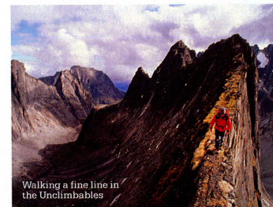
Walking a fine line in the Unclimbables

GETTING THERE: From Ottawa or Montreal, fly to Iqaluit, Nunavut, then take a puddle-jumper to Pangnirtung, a town about 15 miles south of the park. From there, boat across an iceberg-filled fjord to the trailhead. Black Feather offers 10- to 14-day backpacking trips ( from $3,100; blackfeather.com ).