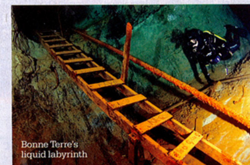
Bonne Terre's liquid labyrinth

More than 50 charted trails are in the mine, threading narrow tunnels littered with old magazines, rock drills, and half-filled ore carts that still sit where the miners dropped them 50 years ago, like the last vestiges of a working man's Atlantis. The most popular paths are overhung with stadium lighting, which illuminates the water's 150 feet of visibility. Wetsuits are highly recommended — the water stays a brisk 60 degrees year-round. To avoid getting lost in this industrial-size ant farm, certified divers must go in the water